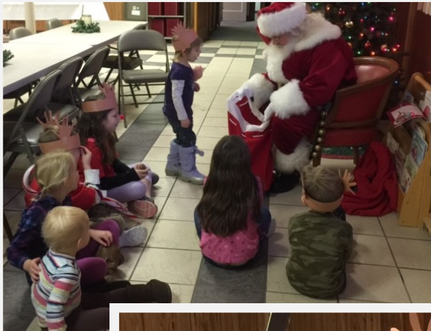
The children of the church enjoyed a Christmas Party on the afternoon of December 18. Santa visited, we played games, dressed others like Christmas trees, and decorated cookies.